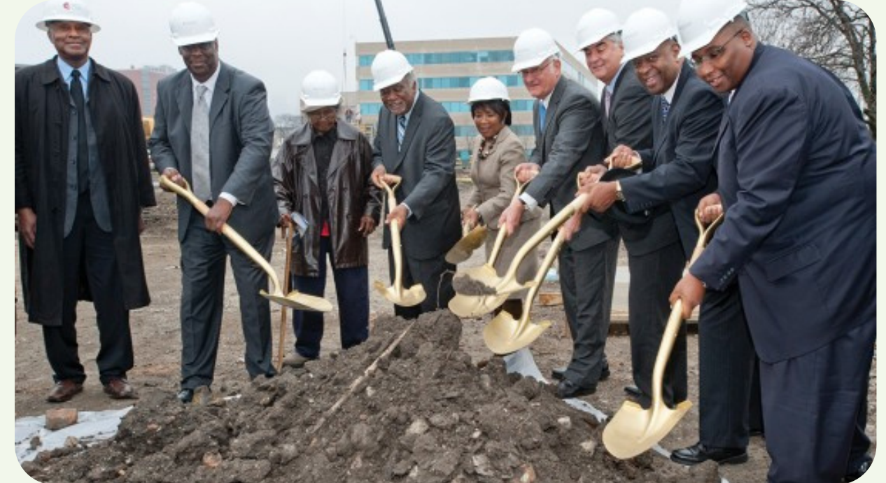
In collaboration with the UIC Health leadership, she built the Miles Square facility on Roosevelt Road.

Two major publications resulted from her work on NAM committees: Retooling for an Aging America ; Building the Healthcare Workforce and Opportunities for Improving Programs and Services for Children with Disabilities . She has also been invited to participate in White House conferences/calls regarding student success and affordability in higher education, opioid use, budget, and mental health.