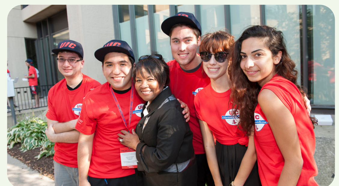
She created a campus/central focus on formalizing STEM at the undergraduate level, as PI of the Biomedical Bridges to Baccalaureate and the Health Sciences Exchange grants.