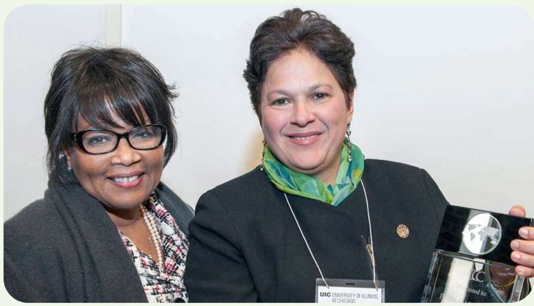
She received an award from the Consul General of El Salvador for Support of International Academic Exchanges.