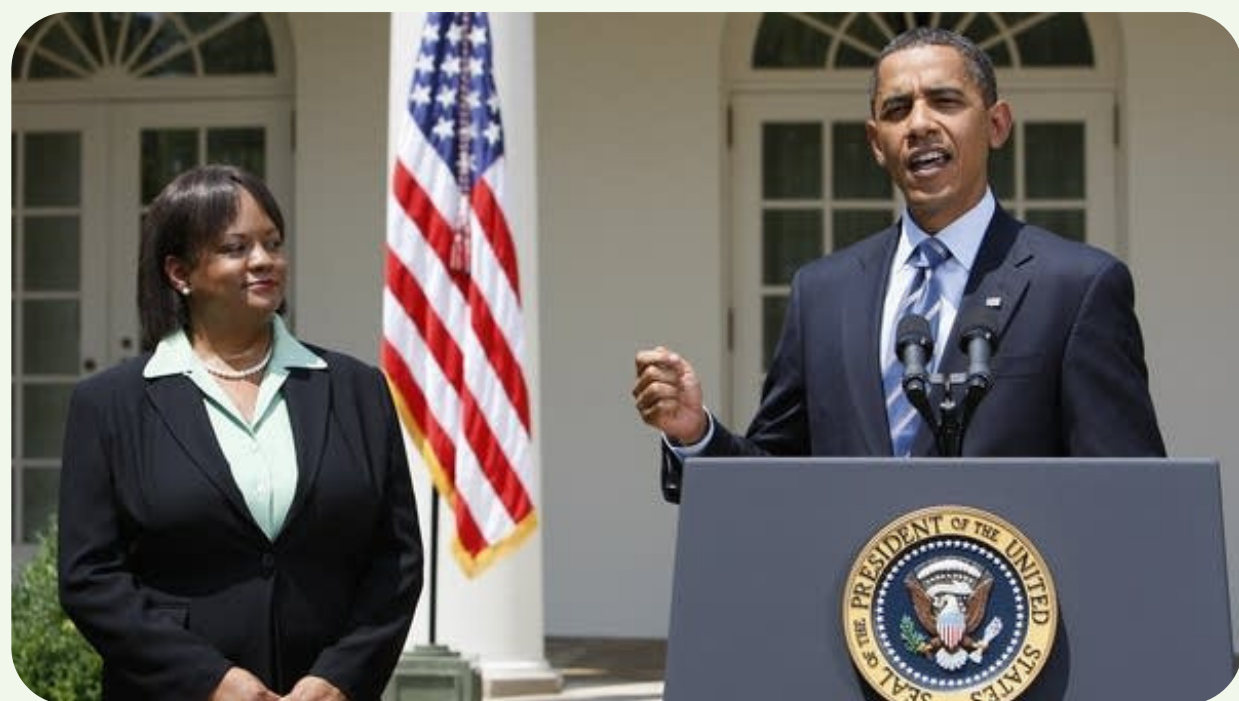
Benjamin accepting President Obama's nomination for U.S. Surgeon General in July 2009.

Dr. Benjamin's career has taken some interesting twists. While completing her undergraduate degree in chemistry from Xavier University in New Orleans, she served as a student intern-trainee for the Central Intelligence Agency. After earning her doctor of medicine degree in 1984, she served her internship and residency in family practice at the Medical Center of Central Georgia at Macon. From 1990 to 1995 she was a medical director at several nursing homes, and in 1993 she went on a medical mission to Honduras.