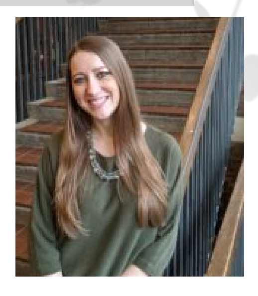
1 Intern Desired