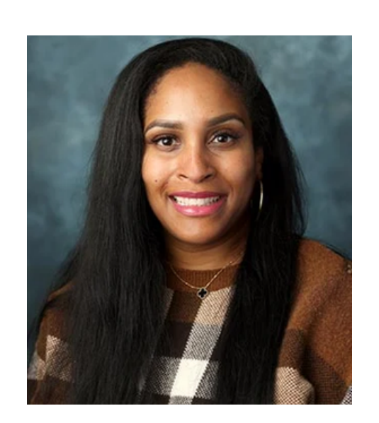
1 Intern Desired