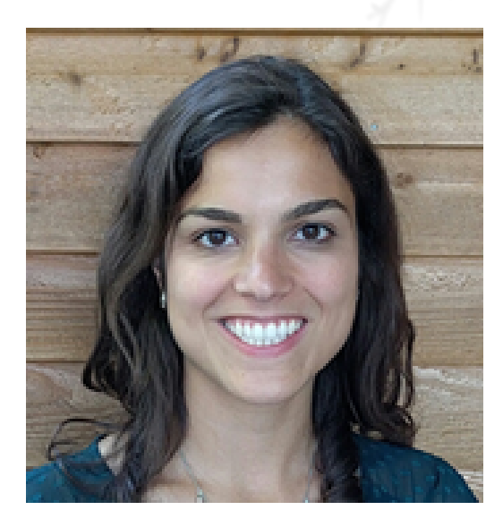
1 Intern Desired